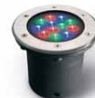
ArcSource Inground 12