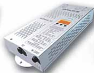
ArcPower 72, ArcPower 36/K2