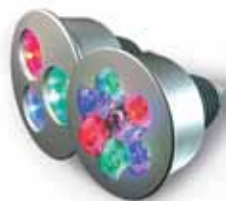
ArcSource 3, 6, 7