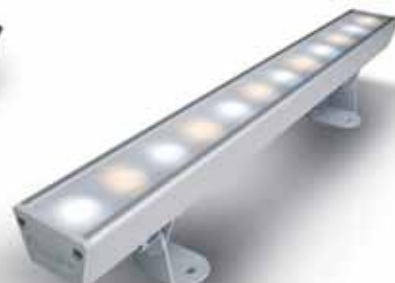
ArcLine Optic 12, 24, 36 SW