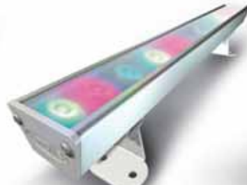
ArcLine Optic 12, 18, 24, 36