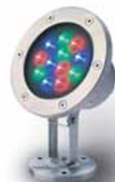
ArcSource Outdoor 12