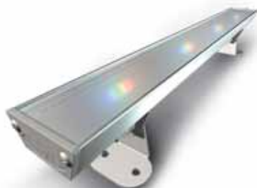
ArcLine 12, 18, 24, 36