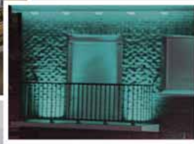
Krys Optical | Wattrelos, France

Krys is a leading French optical retailer. The exterior of their flagship store in Wattrelos, near Lille, has been lit with a combination of Anolis ArcLine Outdoor Optic 36 fixtures and ArcSource Outdoor 12s. They were specifically looking for a spectacular and environmentally-friendly lighting effect.