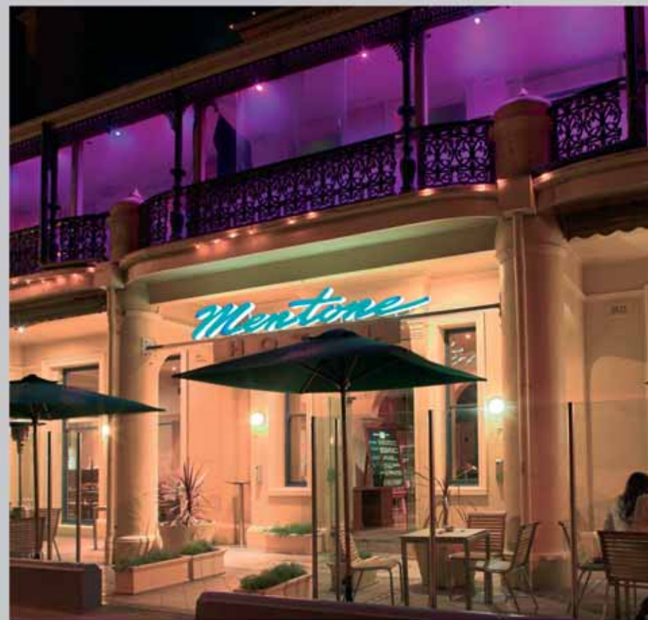
Mentone Hotel | Melbourne, Australia

The Mentone is a busy venue in close proximity to the beach of the same name, located in one of Melbourne's most desirable suburbs. Anolis ArcSource LED fixtures have been installed to the ceiling of the exterior balcony running along Beach Road, which can be clearly seen and acts as a beacon, attracting attention to the Mentone.