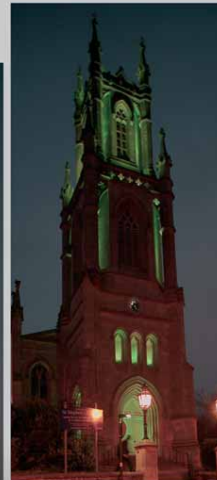
St Stephen's Church | Bath, The United Kingdom

An elegant Anolis LED lighting installation highlights the newly renovated tower of St Stephen's Church in Bath. The lighting scheme has given the restored tower a life of its own. When lit, it is visible from all over the city, and it has become a local talking point.