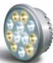
ArcSource 12 SW