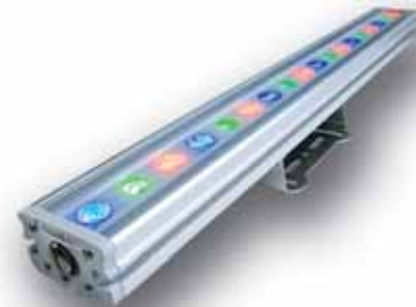
ArcLine Outdoor Optic 18, 24, 36