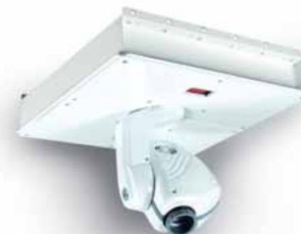
ArcSpot Recessed 170