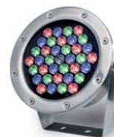
ArcSource Outdoor 36