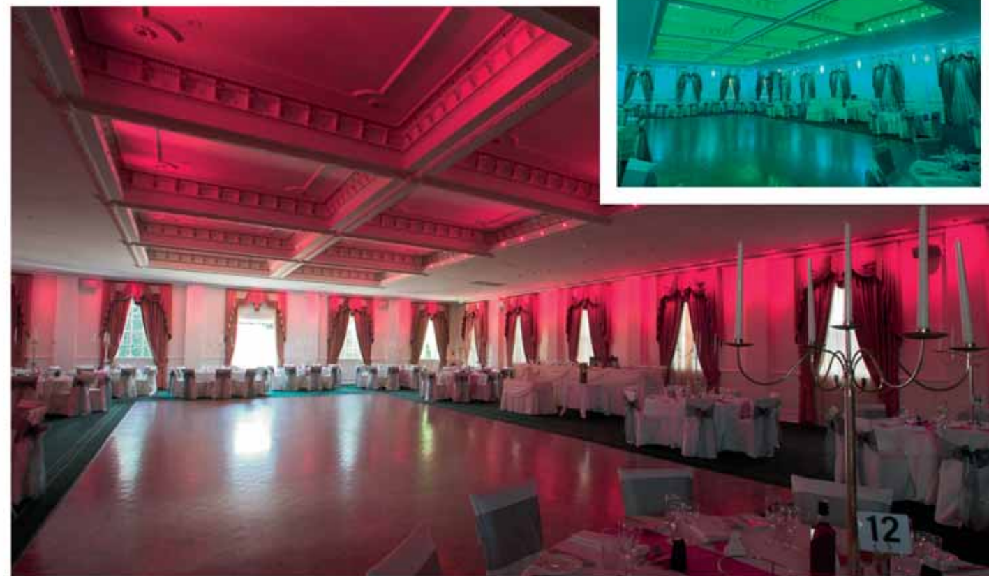
Grand Ballroom of the Merrimu Reception Centre | Melbourne, Australia

Anolis LED fixtures have been installed into the Grand Ballroom of the Merrimu Reception Center in Melbourne, Australia. Merrimu is a venue focussed on hosting functions and receptions of all types. The original homestead was bulid in 1882 and converted into a reception venue in 1955, with the Grand Ballroom - seating up to 400 guests.