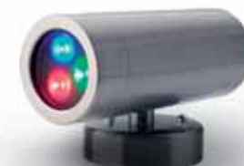
ArcSource Twin Wall 3