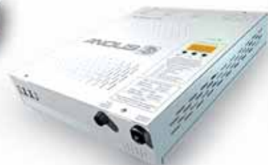
ArcPower 144, ArcPower 72/K2