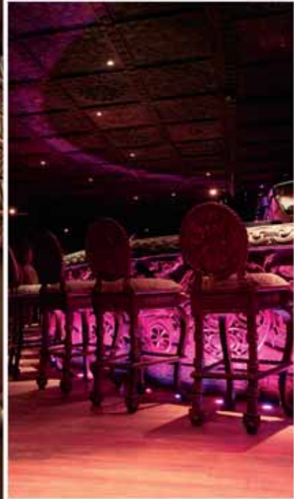
Gilgamesh Restaurant | London, The United Kingdom