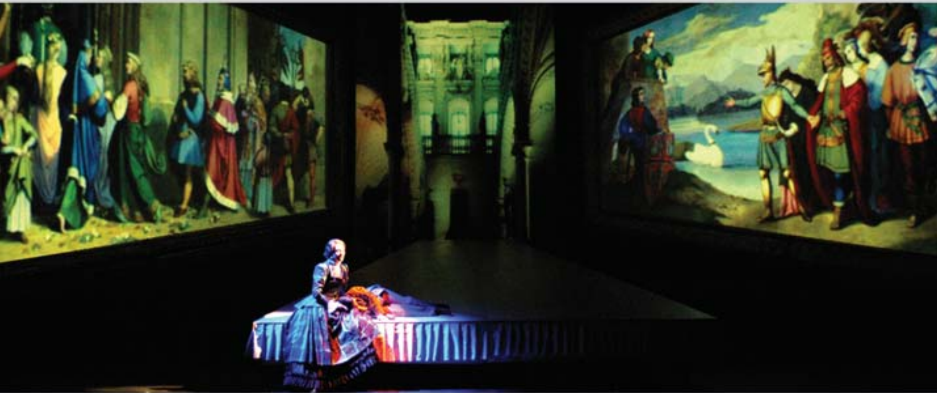
LUDWIG 2 - FESTSPIELHAUS NEUSCHWANSTEIN