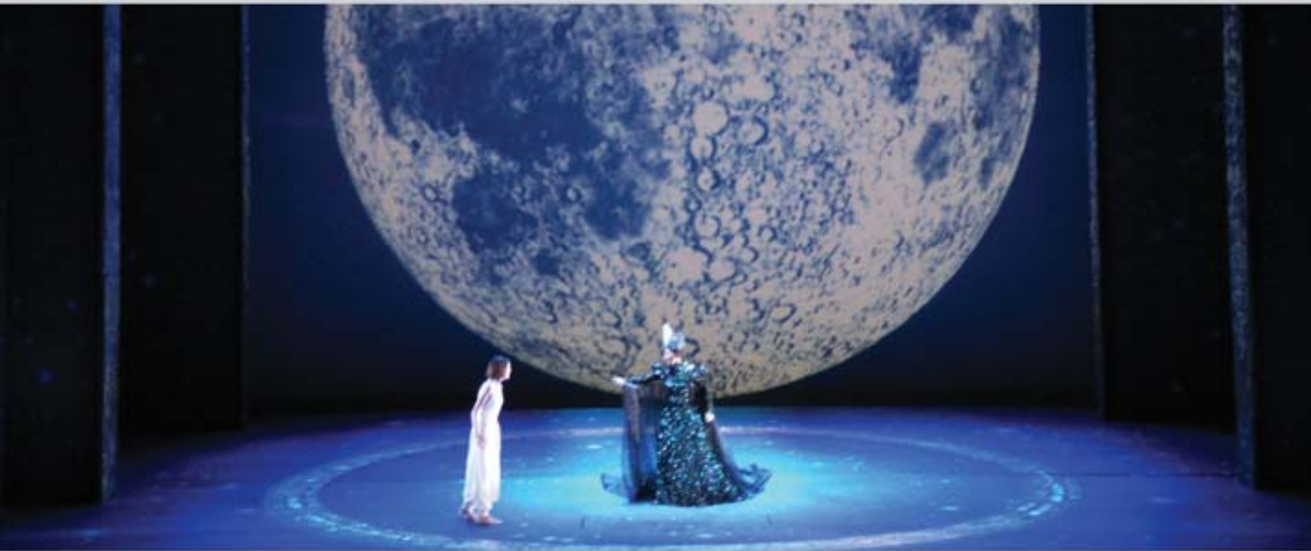
THE MAGIC FLUTE - ATHENS CONCERT HALL